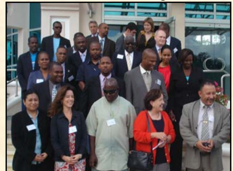
Participants at the Regional Meeting