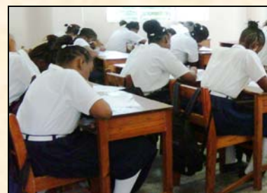
Students Participating in the Research Study