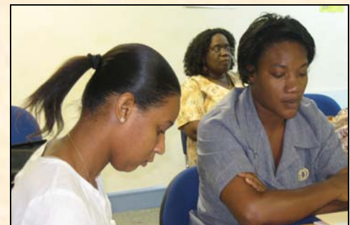
Teachers at Workshop, 7 & 8 January 2009