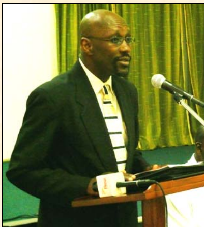
Honourable Karl Hood, Minister for Health Addressing Consultation, 12 February 2009

The Carlton House Treatment and Drug Rehabilitation Centre was located at Parade in St. George's. The building was damaged by Hurricane Ivan in 2004 and destroyed by fire the following year.