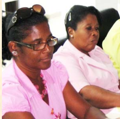
Participants at the Workshop, 22 January 2009

A s part of its public education programmed, the Drug Control Secretariat presented a paper on, "Linkages Between Drugs and HIV/AIDS", at a workshop held 22 January 2009. Over twenty-five participants from the Public and Private Sectors attended the workshop.