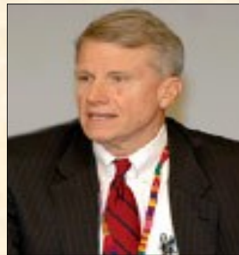
File Photo: Ambassador James Mack